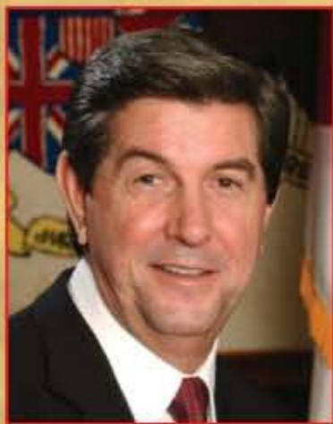
Honorary Guest Speaker Bob Riley Governor State of Alabama